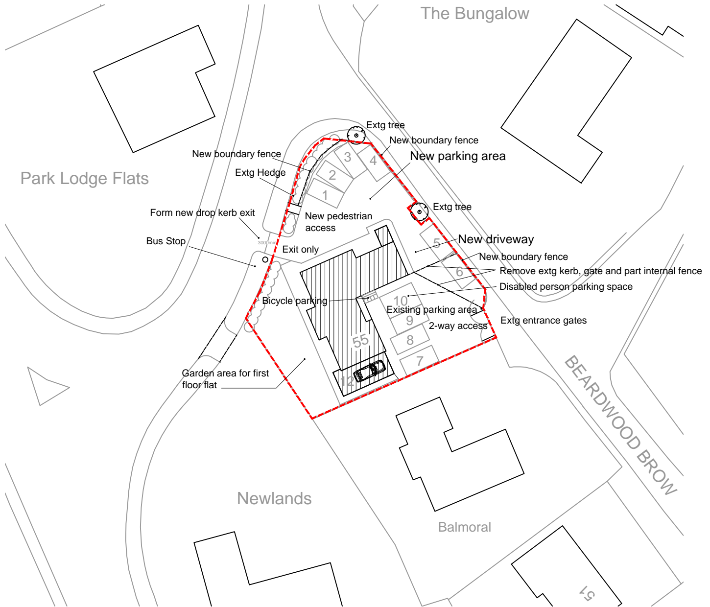
BLOCK PLAN. SCALE 1:500